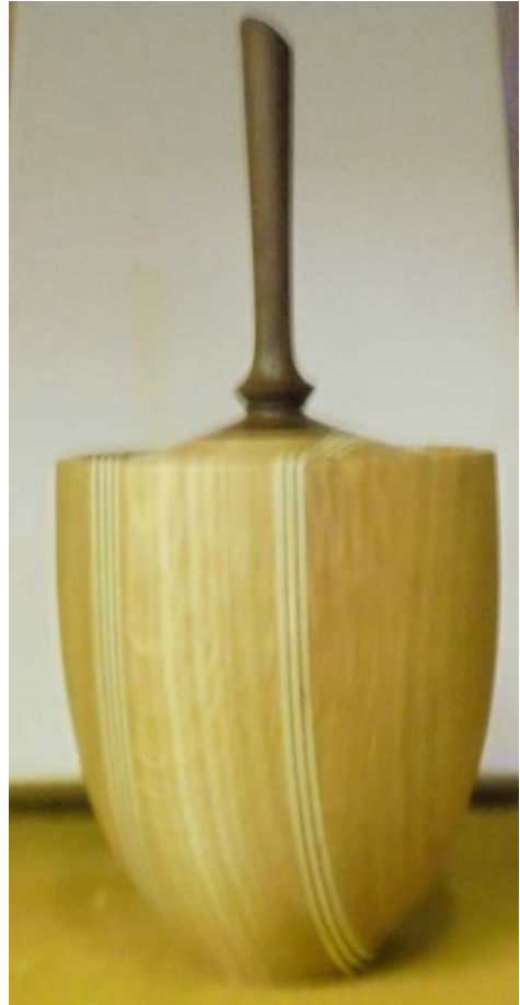
2. Billy Ferris